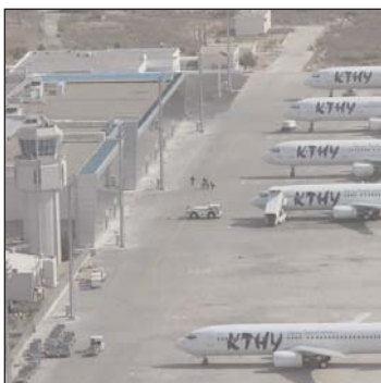
Ercan State Airport