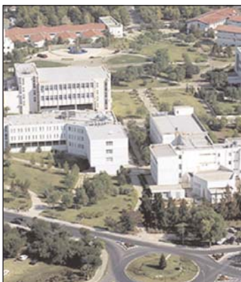
Eastern Mediterranean University

"A trustee committee for the California State system declined Wednesday to suspend an overseas study program on conflict resolution held on the divided island of Cyprus.