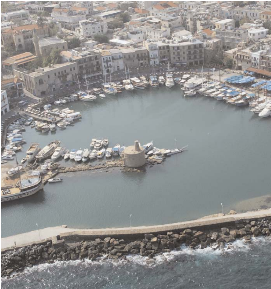
Girne Yacht Harbour

Ever since the hijacking of the 1960 Republic of Cyprus by the Greek Cypriot partner, all the means and the privileges of the Republic have been utilized for the welfare of solely the Greek Cypriot population. The Greek Cypriot administration, under the title of the so-called "Republic of Cyprus", continue to be one of the most subsidized countries in the world, receiving massive aid from the international organizations such as IMF and EU. If the Turkish Cypriot partner was not prevented from exercising its co-founder rights, Turkish Cypriot people would have enjoyed the same economic welfare and proportionate